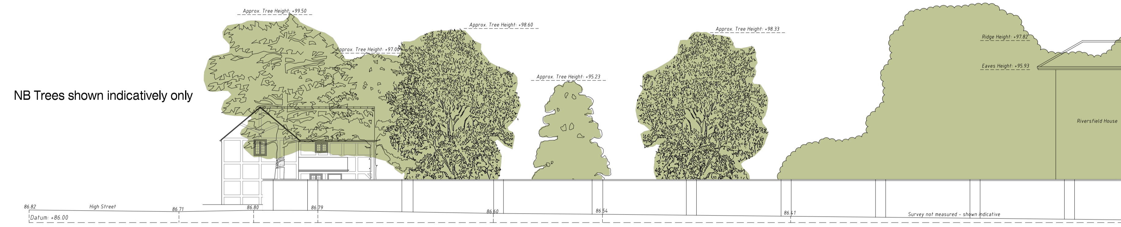
Existing Streetscene from Riversfield Drive Scale 1:150 - Viewing East