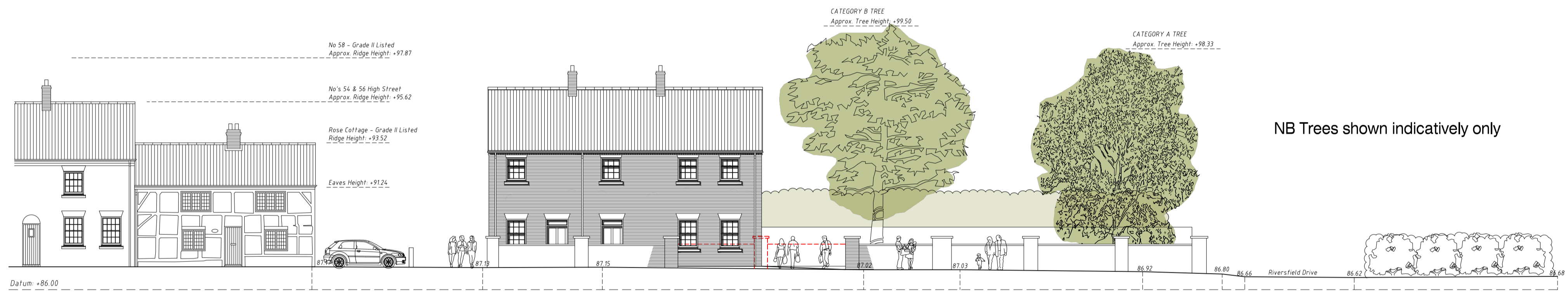
Proposed Streetscene from High Street Scale 1:150 - Viewing South